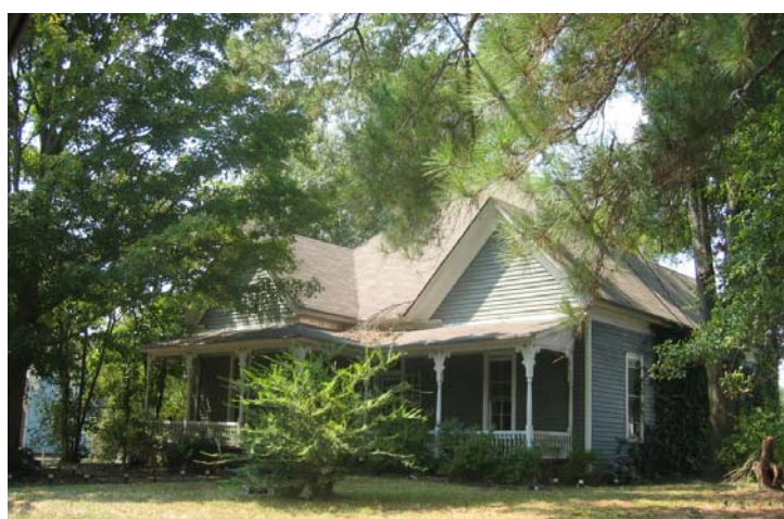
Entrance to Residential Longview Street