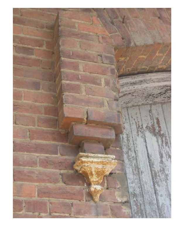
ARCHITECTURAL DETAILS OF THE CARROLLTON DEPOT