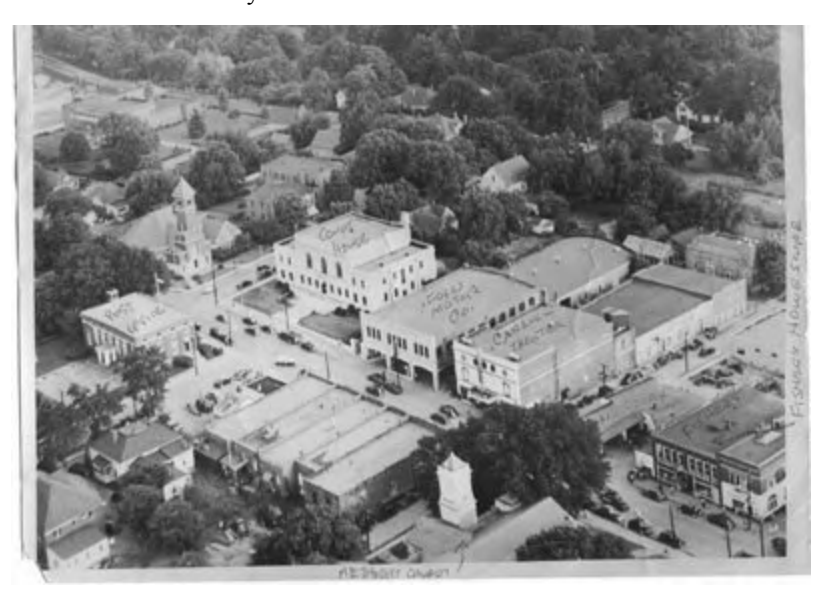
Overhead picture of Newnan St. area - M.L. Fisher - 1946