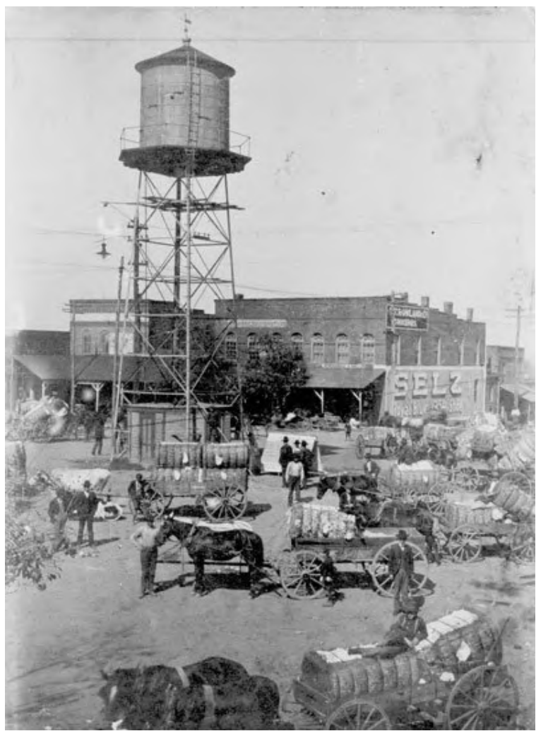
Square with water tower - B. M. Long Photograph Album: donated by Aubrey Jones: Special Collections: SUWG