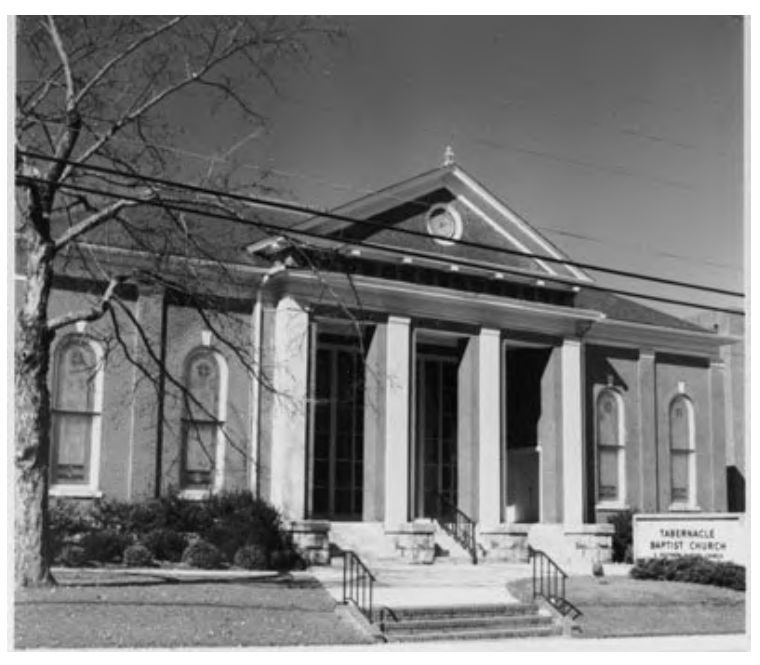
Tabernacle Baptist Church, Bradley Street - Bobby Powell: Special Collections: SUWG