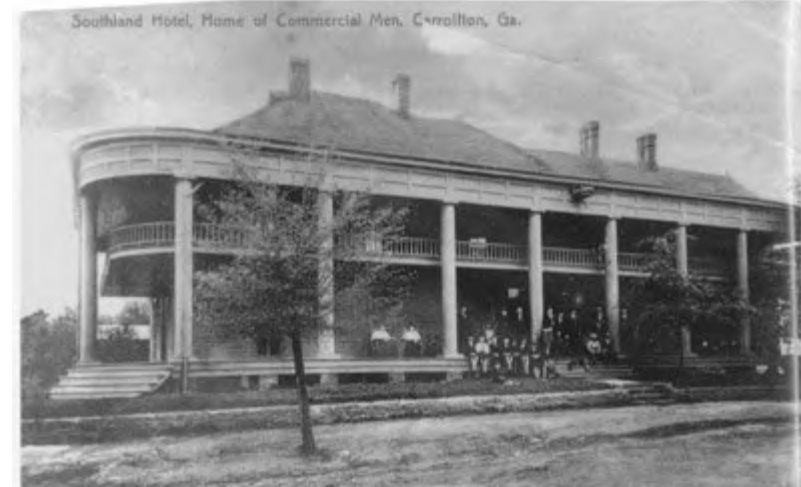
Southland Hotel Rebuilt on Newnan Street

If you enjoy these old photographs, be sure to visit the CCHS web-site www.carrollcountyhistory.org to see over a hundred more. Click on "Extras" and select "Reeve Ingle Gallery" to access the wonderful "Reeve Ingle Project Years 1900—1999". (All photo credits are shown in the Gallery.)