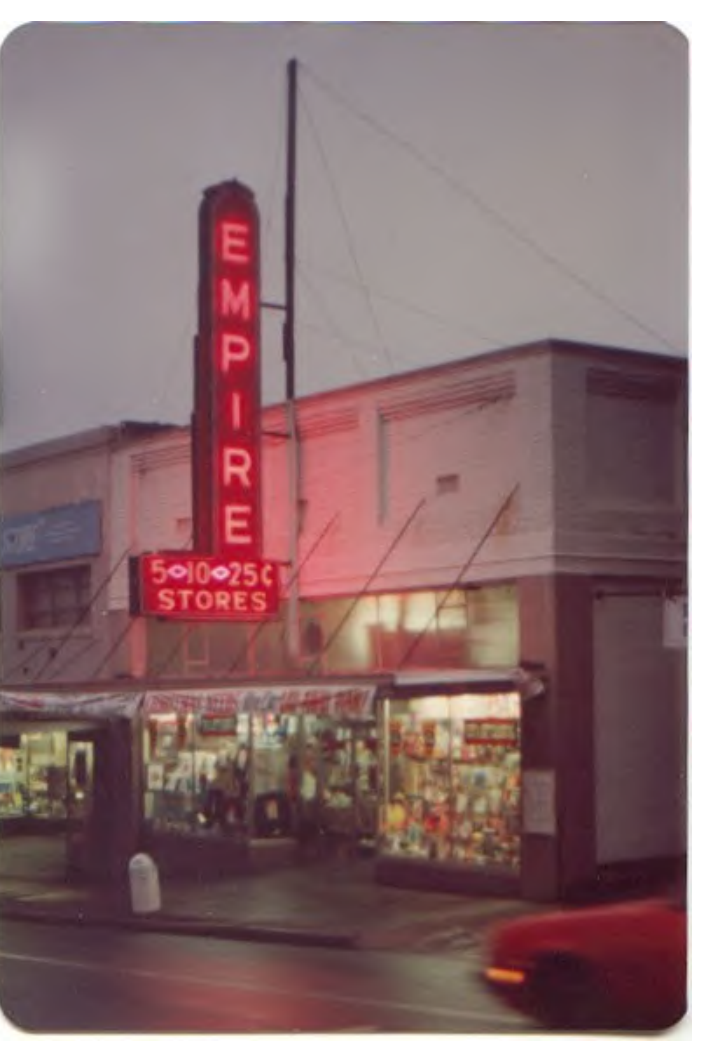
Empire 5-10-25 Store off Adamson Square at Christmas